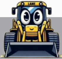
Lane the Loader™

CAGC Foundation fuels Lane the Loader™ across the Carolinas with construction-themed books. Our supporters choose which books, how many and the destination - schools, libraries, or even children's hospitals for Lane to deliver with their custom dedicated label inside.