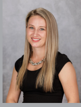
Marianne Bush Foundation Workforce Development & Program Operations Manager